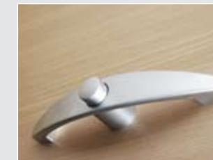
Positive locker catches For secure storage even whilst on the move

The Bessacarr E400 Series offers two fuel-efficient low-line models and three high-line models with large, comfortable overcab bed. All models have full over-cab GRP moulding, stylish moulded rear light panel and a gloss white front bumper complementing the class-leading performance of the Fiat X2/50 Ducato which is available with powerful 100 or 130 MultiJet diesel engines.