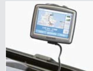
Optional reversing camera and navigation unit Reversing camera with screen mounted on rear view mirror and separate portable navigation unit