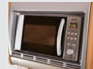
Microwave oven Built in 700W microwave oven