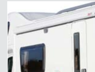
Optional roll-out awning