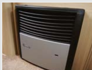
Dual fuel heater On-site and en-route operation

Well equipped kitchens have a dual fuel hob, separate oven and grill, digital fridge with automatic energy selection and a microwave oven as standard and there are ample 230V sockets for modern power demands. To personalise your E400 model there are options including a roll-out awning, cab air conditioning and a reversing camera combined with Sat Nav.