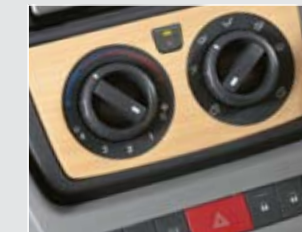
Optional cab air-conditioning