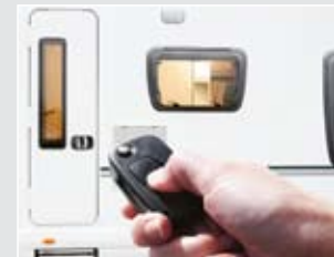
Central locking New high specification entrance door with remote central locking