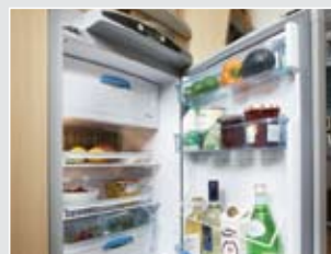
SES digital fridge Digital controls and automatic energy selection